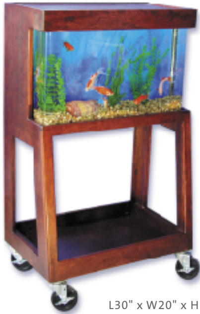
L30" x W20" x H54"

Some Things Fishy invented the rolling aquarium.